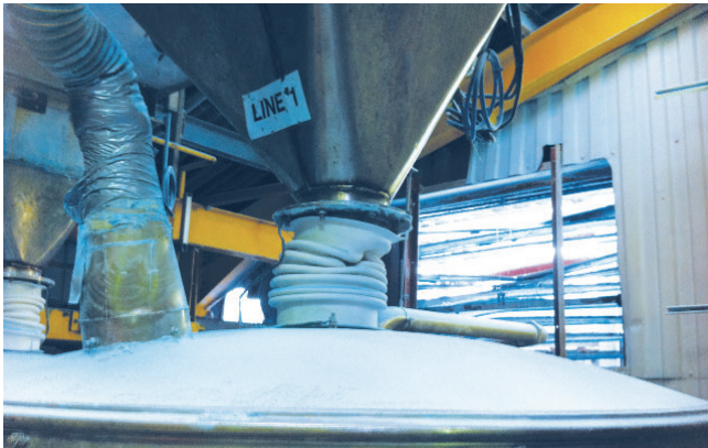
VIBRATORY FEEDER INLET - BEFORE

A leading UK plaster manufacturer was having an issue with the flexible connectors on a vibrating sieve lasting only a week at a time before tearing, causing major dust leakage and requiring significant maintenance downtime. Plaster is very fine and is difficult to contain, but since installing BFM® fittings, there are no dust leaks and the connectors have already lasted more than 50 times longer than the previous jubilee-clip fastened connectors.