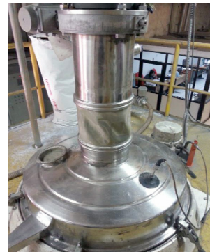
SIFTER FEED - AFTER