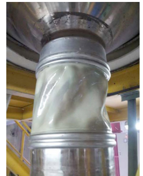
UNDER SIFTER - AFTER