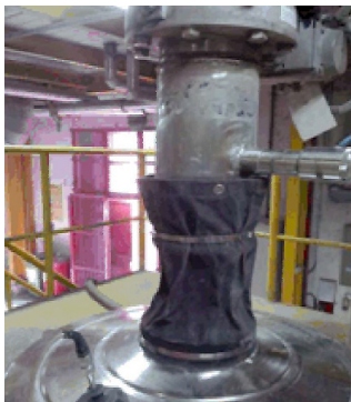
SIFTER FEED - BEFORE

PT Jotun Powder Coatings, Indonesia is a leading supplier of powder coatings to companies in the appliance, furniture, building components and other general manufacturing industries. The paint pigment dust was causing a considerable health hazard to their workers. Installing BFM® fittings to their production area has completely eliminated dust in the factory, and downtime has also been drastically reduced.