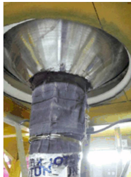
UNDER SIFTER - BEFORE