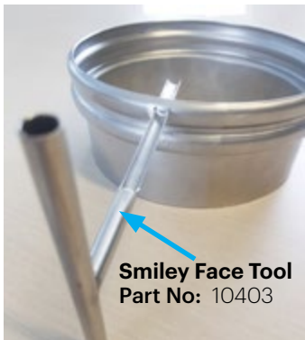
Smiley Face Tool Part No: 10403

Using a ratchet spanner, the bolt is tightened until the pneumatic punch head pushes through the spigot cuff (this may take a minute to wind tight enough to activate the punch).